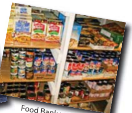
Food Bank vouchers