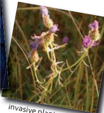
invasive plant mapping